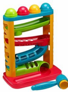
Hammer and Ball

Remembrance Day Ceremony: Parents are welcome to come to the ceremony and students are invited to wear their brownies, sparks, scouts, cubs, etc. uniforms. The exact time is still to be determined.