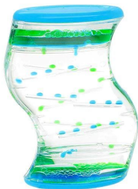
Cascade S Timer